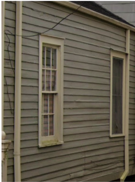
Original Wood Windows