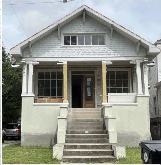
May 20, 2026