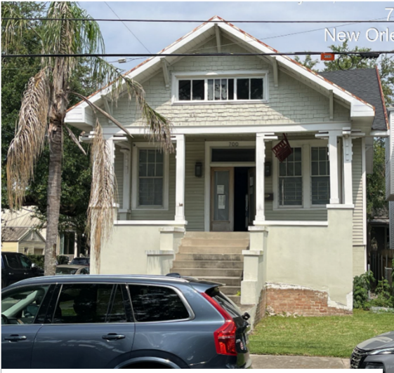
May 22, 2025

reproduce their design, texture, materials, details and their special character and interest in the neighborhood.