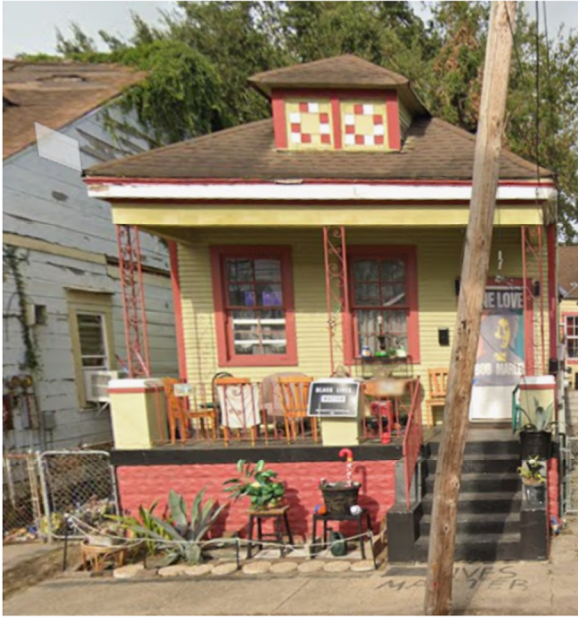
Google Maps 2021

The Commission voted to allow retention of the right side windows (numbered 7,8 on photos below) with the proviso that full screens are added, as they are the least visible from the public right-of-way.