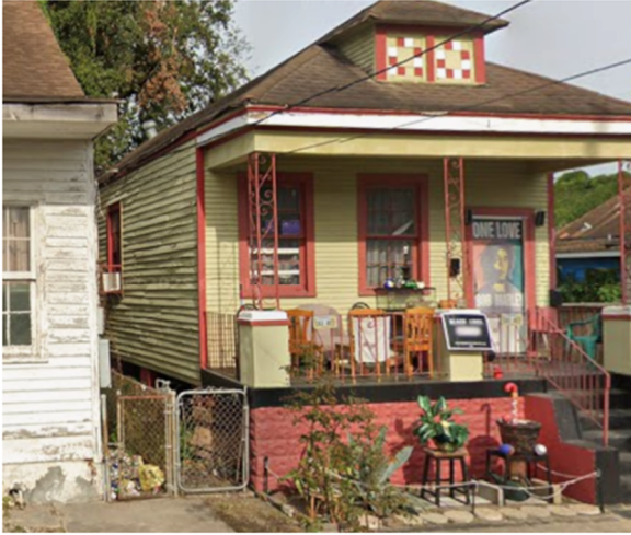
Google Maps 2021